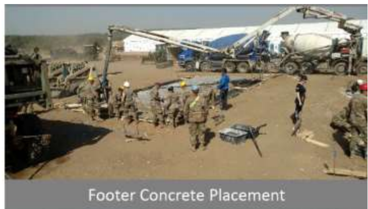
Footer Concrete Placement

On the 416th TEC Facebook page has a link to a video of the 304th Engineer Vertical Company from Lima, OH and their contributions to the exercise.