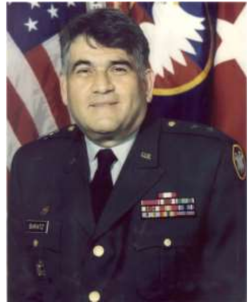
July 1995

A: The major threat today is cyber. The ability to interdict all functions of the military and civilian world is growing exponentially and is by far the most dangerous.