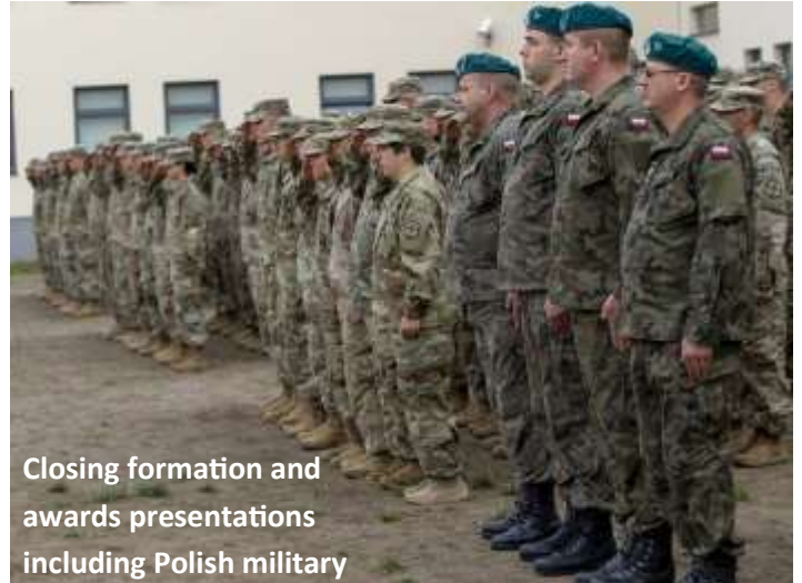
Closing formation and awards presentations including Polish military

Key Tasks: Deploy personnel and equipment; provide and maintain construction equipment; strengthen partnerships with engineers from NATO Allied nations; U.S. guard and active component engineers; improve relationships with host nation (Poland) government, Polish armed forces and the civilian population.