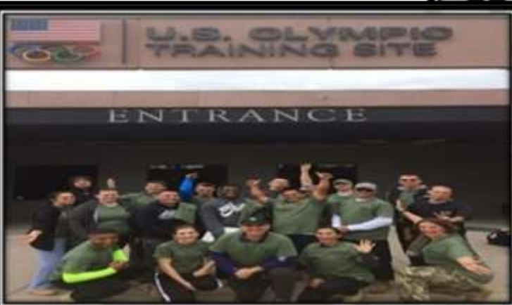
208th Soldiers achieve the end state of training

Soldiers honed their skills on sportsmanship, tactics/strategy, troop leading, planning, and physical conditioning.