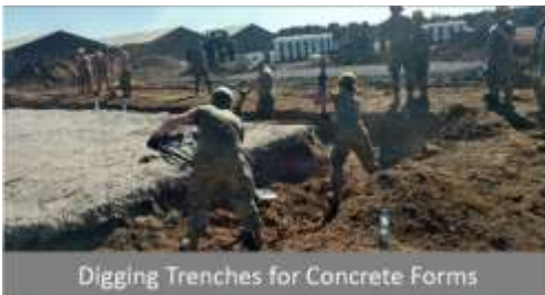
Digging Trenches for Concrete Forms